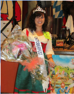
Miss Oktoberfest 2015

Tapping of the Keg German Draught Beer Delicious German Food Miss Oktoberfest Contest Live Music by