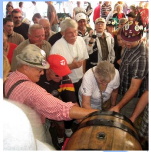
"Munich in Hamilton"

Alpen Trio 3-6pm The Nu-Tones Band 7:30 - midnight